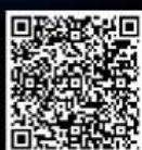
ADULT VOLUNTEER REGISTRATION

REGISTRATION DEADLINES: MAY 1 ST FOR VOLUNTEERS & JUNE 1 ST FOR CAMPERS. CALL 330-644-2225 OR EMAIL VBS@STFPARISH.COM WITH QUESTIONS