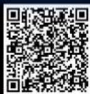
STUDENT VOLUNTEER REGISTRATION