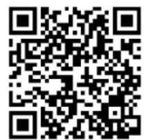
ParishSOFT Online Giving