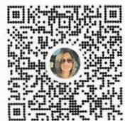
Venmo QR Code

Please send in all donations and business logos prior to Friday, February 9, 2024.