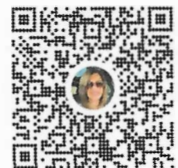
Venmo QR Code

Please send in all donations and business logos prior to Friday, February 16, 2024.