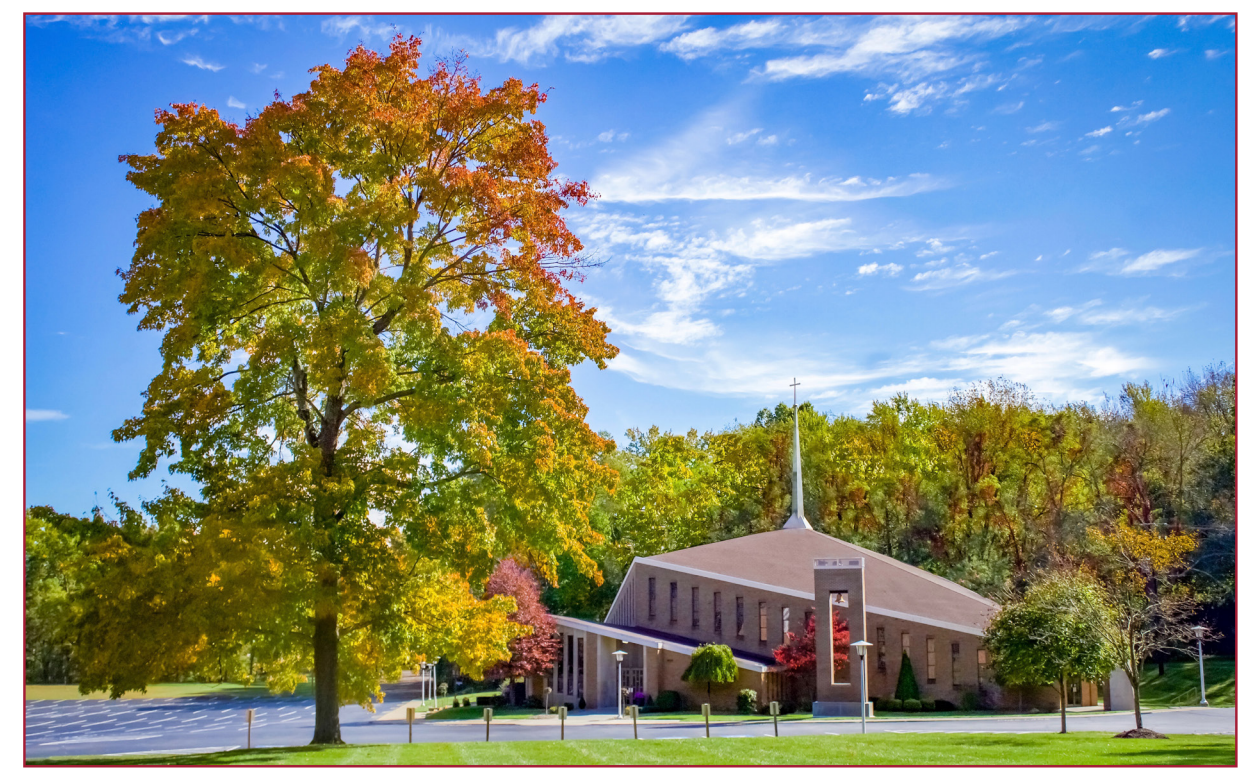
Roman Catholic Church